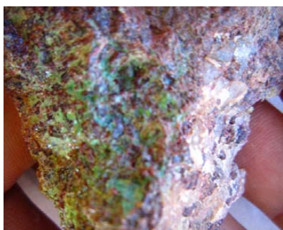
Copper mineralisation at Discovery Pit, Irish Rise