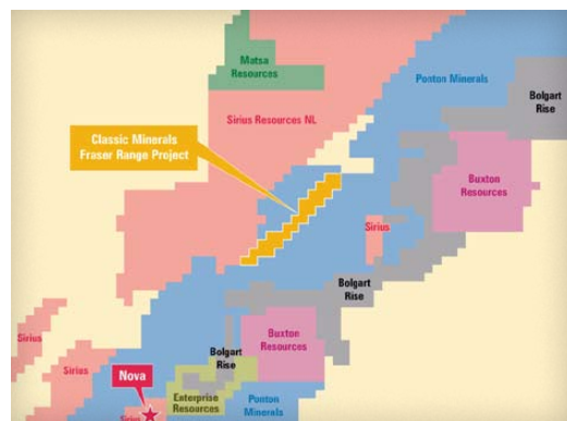
Figure 1. Classic Minerals surrounding tenements

All of these anomalies are considered to be induced by moderate to high conductive targets. The conductive zones within the survey area form a trend continued in SW-NE direction. The linear EM zones correlate with magnetic anomalies and gradients. Since the EM conductors have close associations with the magnetic anomalies they are potential targets.