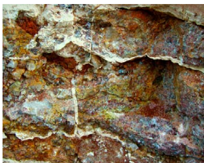
Copper mineralisation at Discovery Pit, Irish Rise