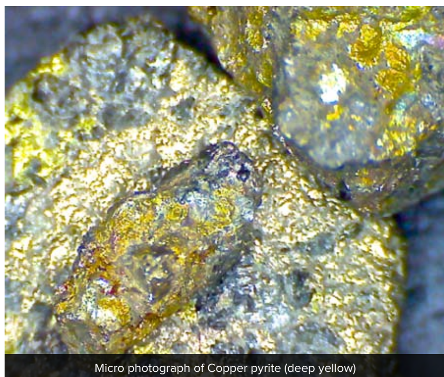
and Pyrite (pale yellow)