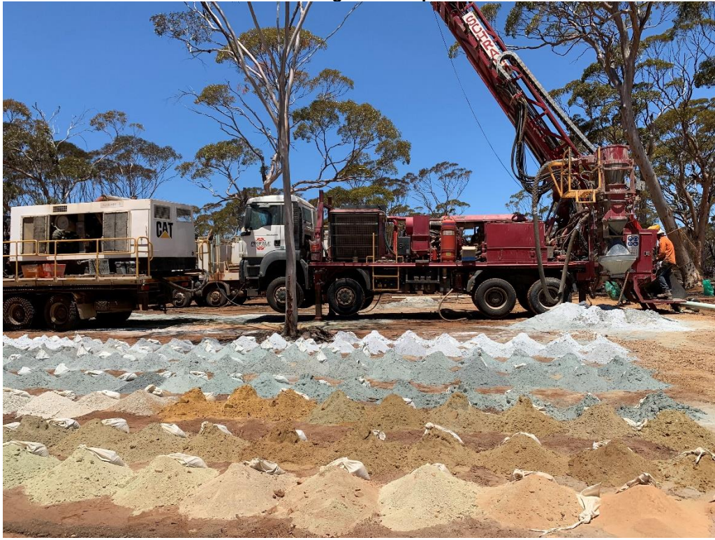
Drilling at Kat Gap: