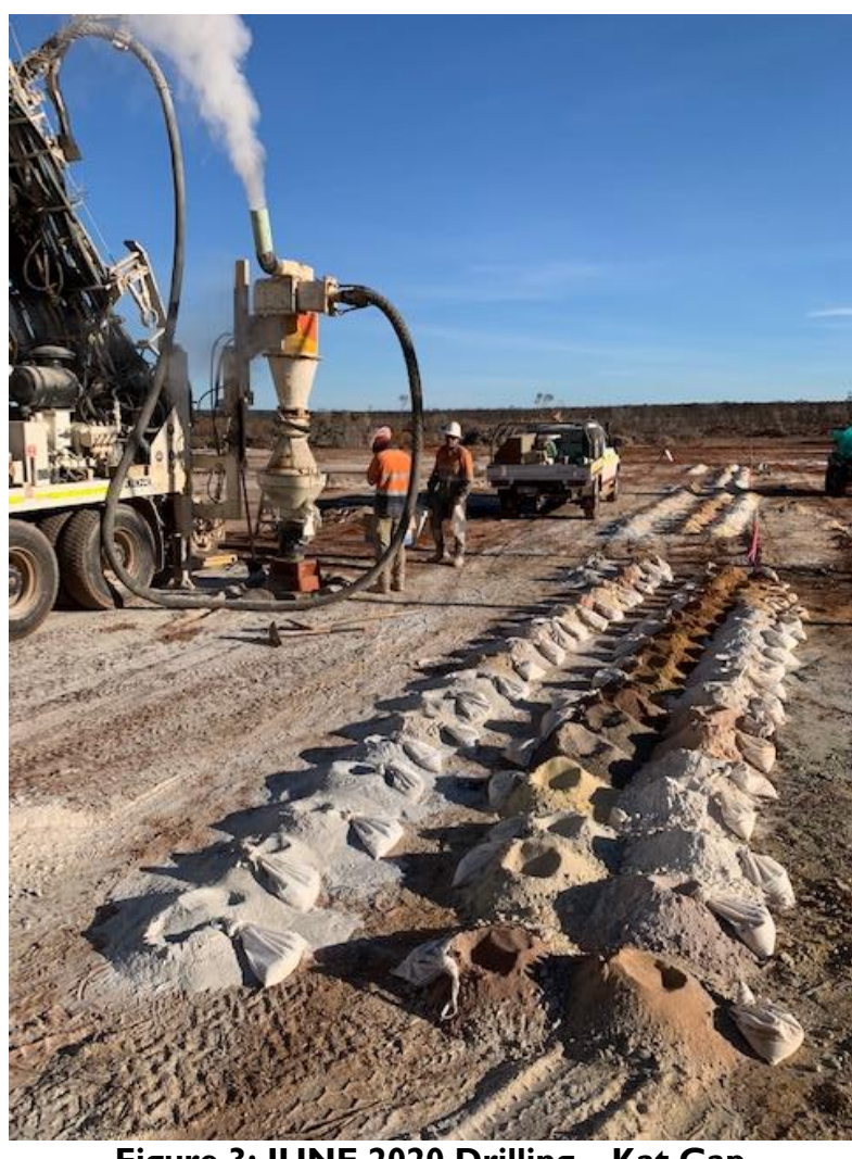
Figure 3: JUNE 2020 Drilling - Kat Gap