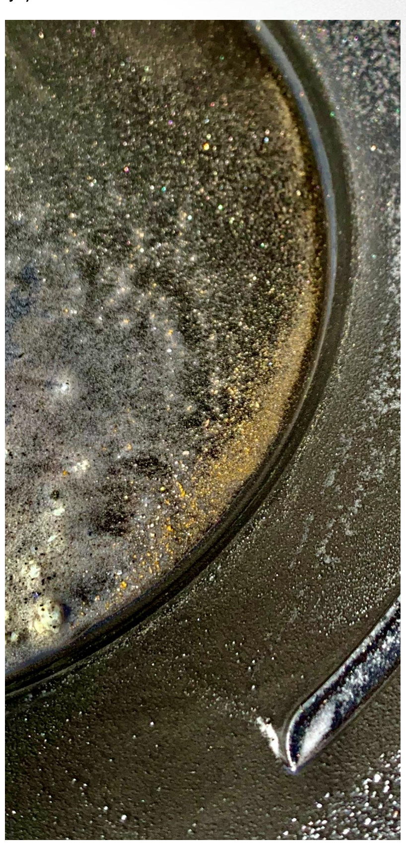
Figure 2: Visible gold in panning dish from hole FKGRC | 84 at 82-83m grading 304 g/t Au.