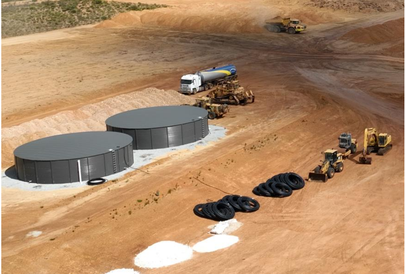
Figure 6: Aerial photo of Turkey's Nest construction.