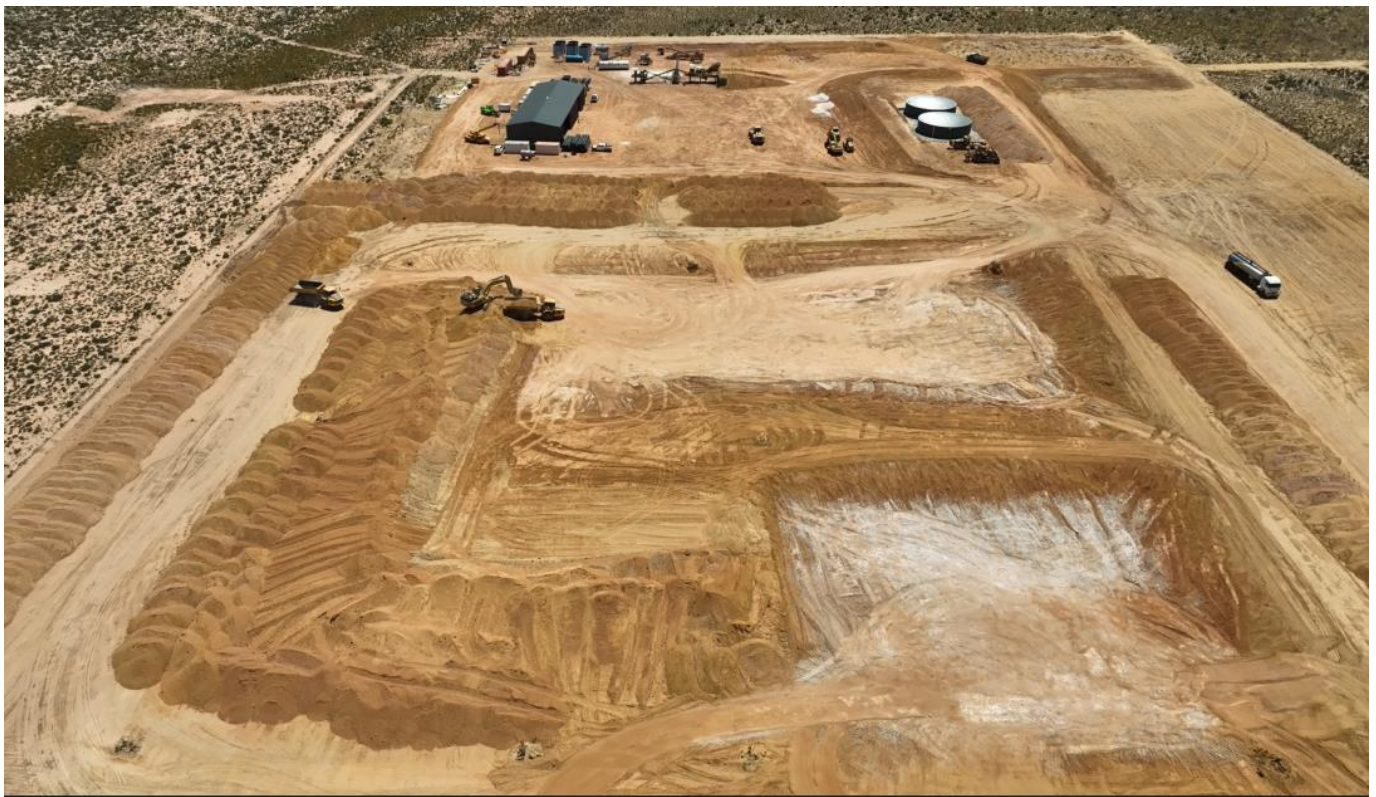
Figure 1: Kat Gap Processing Facility showing TSF progress.

WA-focused gold mining company, Classic Minerals Limited (ASX:CLZ) ( Classic , or the Company ) is pleased to provide an update on activities at Kat Gap.