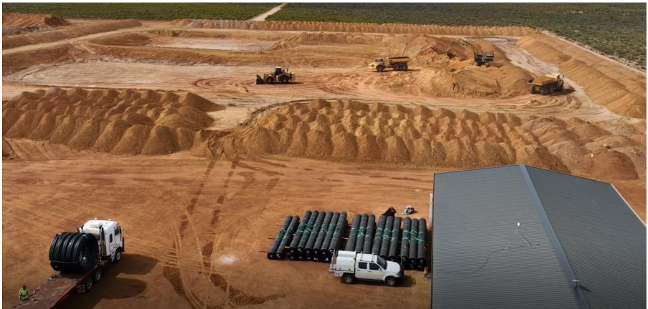
Figure 3 & 4: Aerial photo of Kat Gap Processing Facility showing TSF Liner behind ute and water pipeline on truck.

Figure 8 shows the route the water pipe will take to the water tanks seen in the distance.