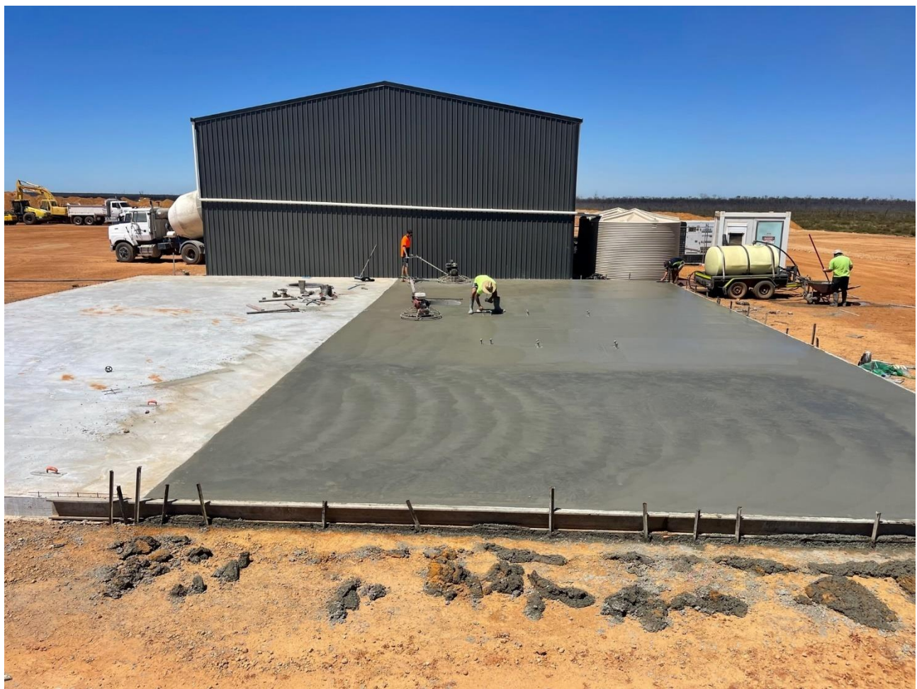
Figure 1: Kat Gap Processing Facility beneficiation plant foundation.

WA-focused gold mining company, Classic Minerals Limited (ASX:CLZ) ( Classic , or the Company ) is pleased to provide an update on activities at Kat Gap.