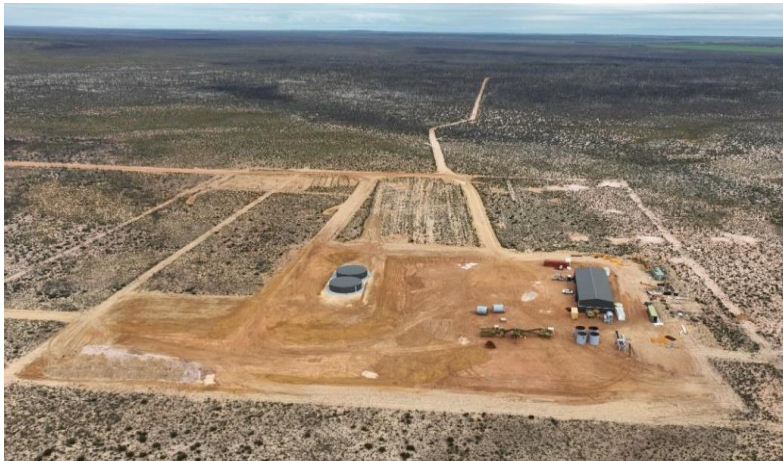
Figure 5, 6, 7: TSF progress.

The following 3 pictures, taken from previous ASX announcements show the visual progress of the Tailings Storage Facility (TSF).