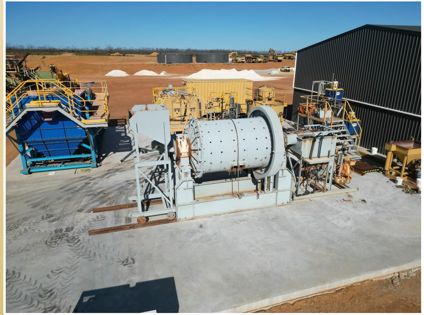
Figure 1: Picture showing Ball Mill, Trommel and water tanks.

WA-focused gold mining company, Classic Minerals Limited (ASX:CLZ) ( Classic , or the Company ) is pleased to provide an update on activities at Kat Gap.