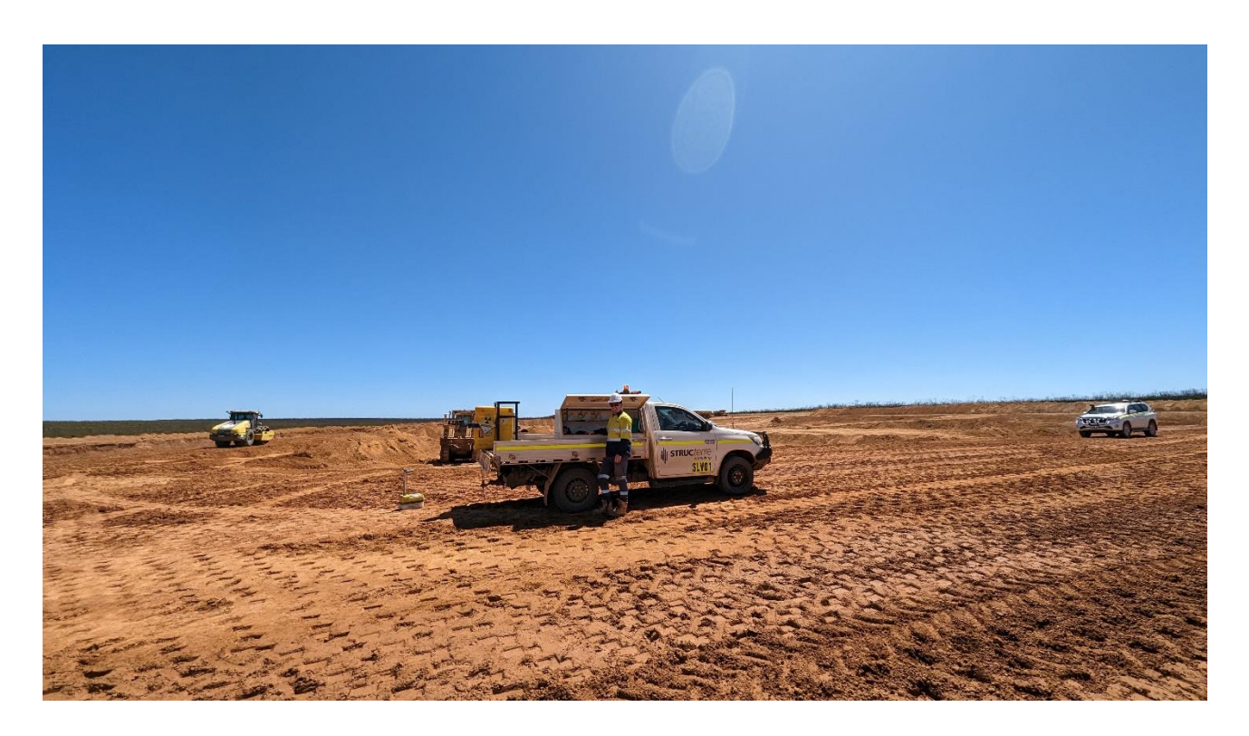
Figure 2: REC Consultants onsite managing the construction of TSF.

The company will continue to provide regular updates to investors as the construction of the plant and site progresses. Investors can stay informed about the progress of the project and other important developments by monitoring the ASX announcements and the company's website.