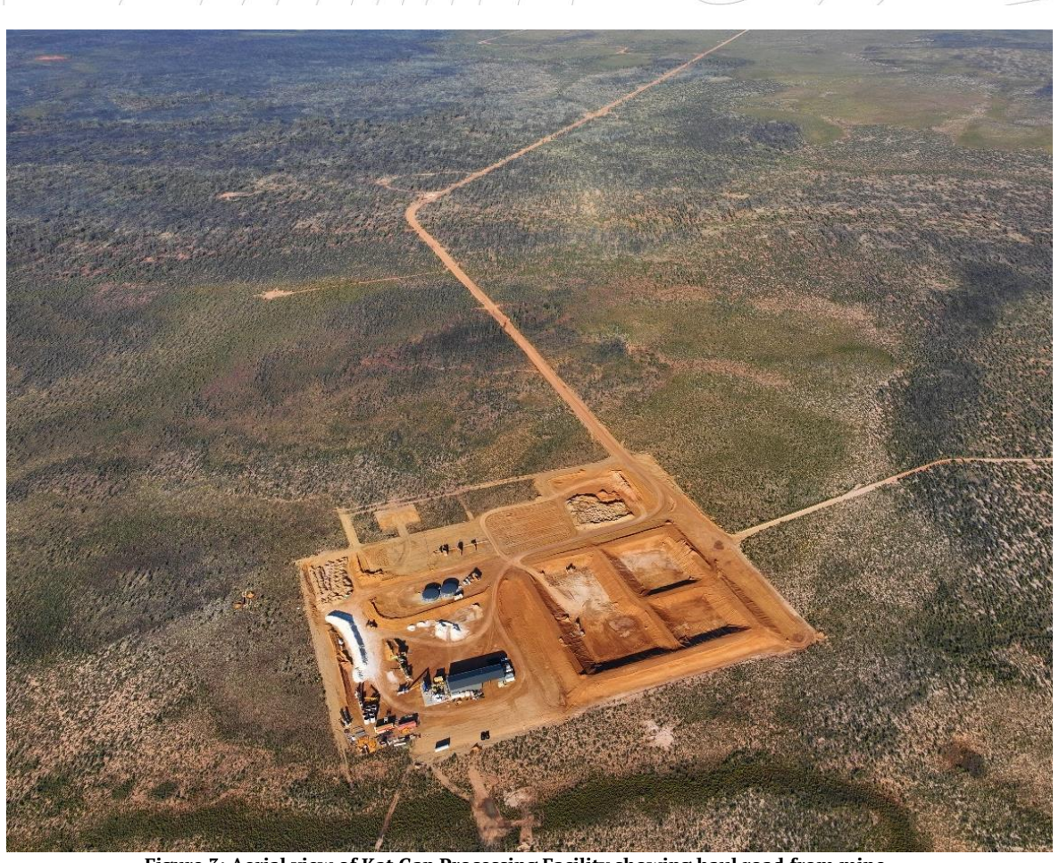
Figure 3: Aerial view of Kat Gap Processing Facility showing haul road from mine. Figure 4: TSF Project Crew

71 Furniss Rd, Landsdale Western Australia 6065 ASX: CLZ | ABN 77119 484 016 contact@classicminerals.com.au