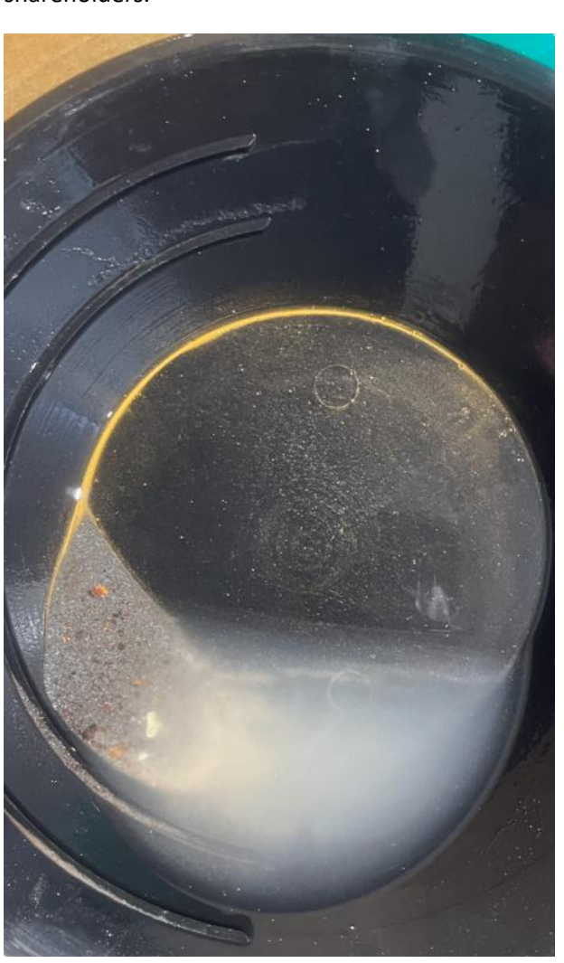
Figure 3: Gold particles from panning concentrate.

Classic Minerals Ltd is grateful for the support and dedication of its employees, stakeholders, and project partners who have contributed to the successful commissioning and completion of the Kat Gap Processing Plant. The company remains focused on delivering strong results and creating long-term value for its shareholders.