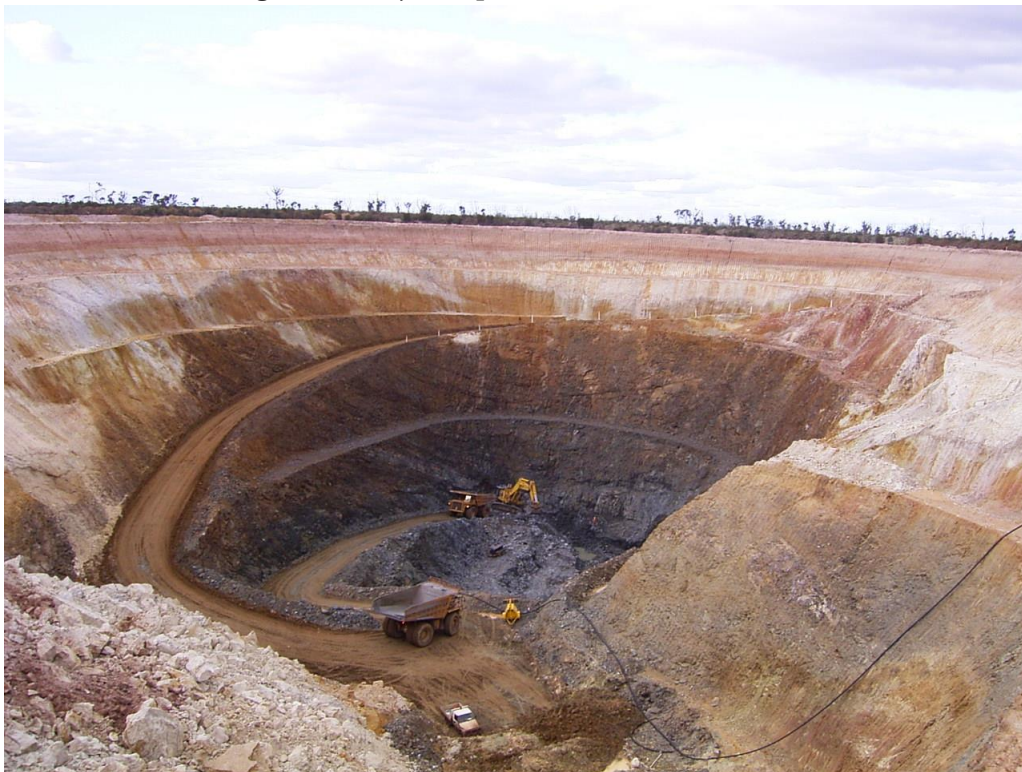
Figure 3: Lady Ada pit on the FGP tenements

Although the FGP Tenements already host a substantial 300,000 ounces of gold, the exceptional exploration potential within this area provides a huge opportunity for the discovery of additional gold ounces outside of the existing indicated and inferred resource base. The historical success of the Forrestania region in hosting significant gold reserves, contributed by various successful mining companies, adds to the significant potential of the area. Classic's 100% control of its own processing facility in the area further positions the company to efficiently explore and process gold resources not only from Kat Gap but also from within the larger Forrestania tenement package. This strategic ownership of all assets grants Classic full autonomy and control over their mining operations, enabling streamlined processes and maximizing returns from their gold projects, reinforcing their position within our WA gold mining industry.