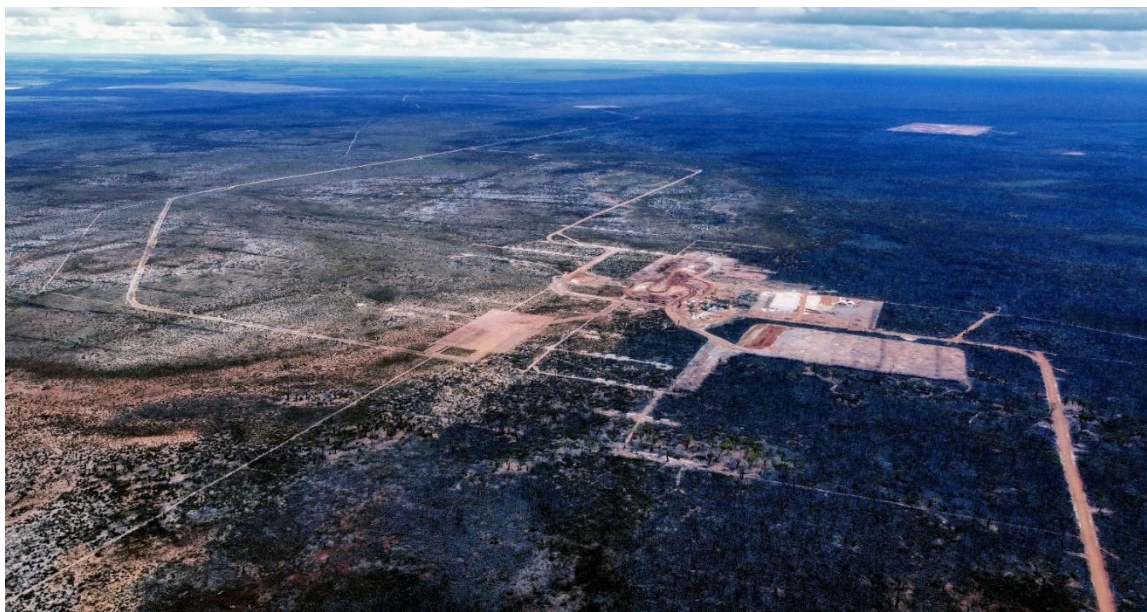
Figure 1 Kat Gap mine site

The Company focused all its efforts during the quarter to bring the Kat Gap gold project closer to production. Most of the work was centred primarily on trial mining and milling activities. This included the calibration of the Kat Gap processing facility to capture data enabling refinement of the gravity circuit operation. Marking out of the trial pit by contract surveyors was also undertaken.