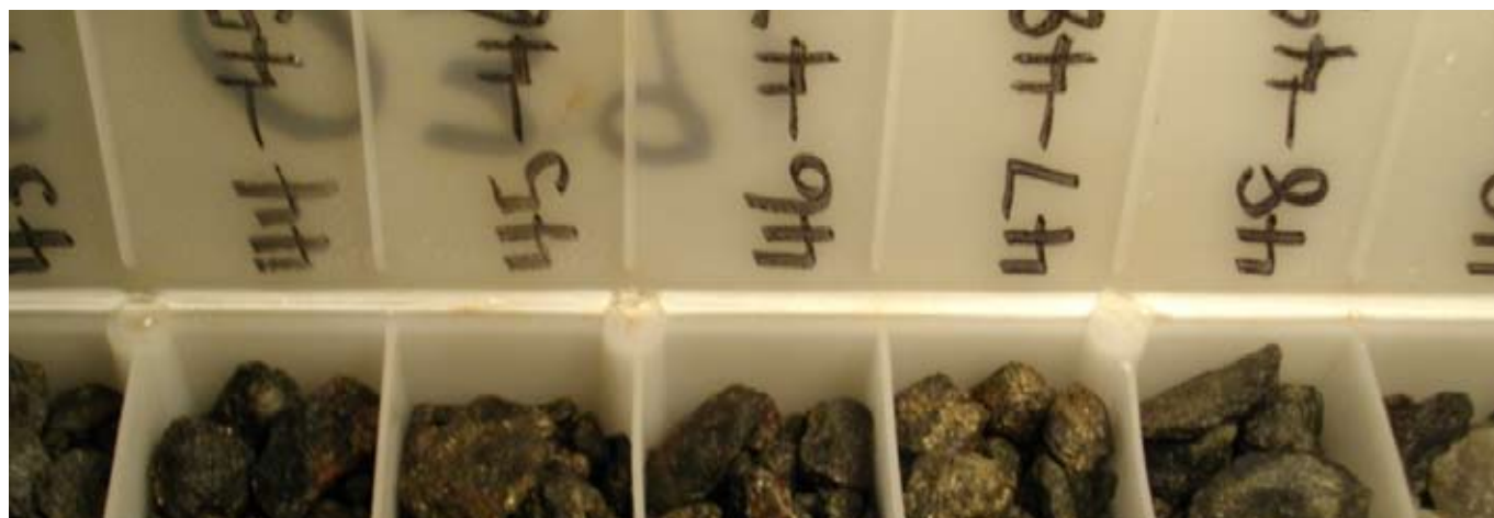
Figure 1: Hole FRR039 chip tray shows 3m sulphide rich intersection of around 15% mixed sulphides @ 0.5% Ni 45m-48m depth

Drilling is continuing to delineate the near surface extent of the mineralization, with the base of weathering at about 25m. This initial drilling is aimed at determining the geometry of mineralised zones which will be used to target depth extensions.