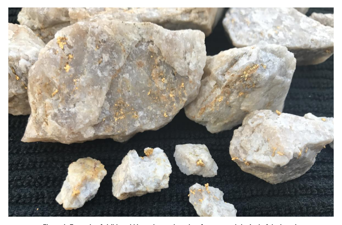
Figure 1: Example of visible gold in rock samples taken from around the Lady Ada deposit