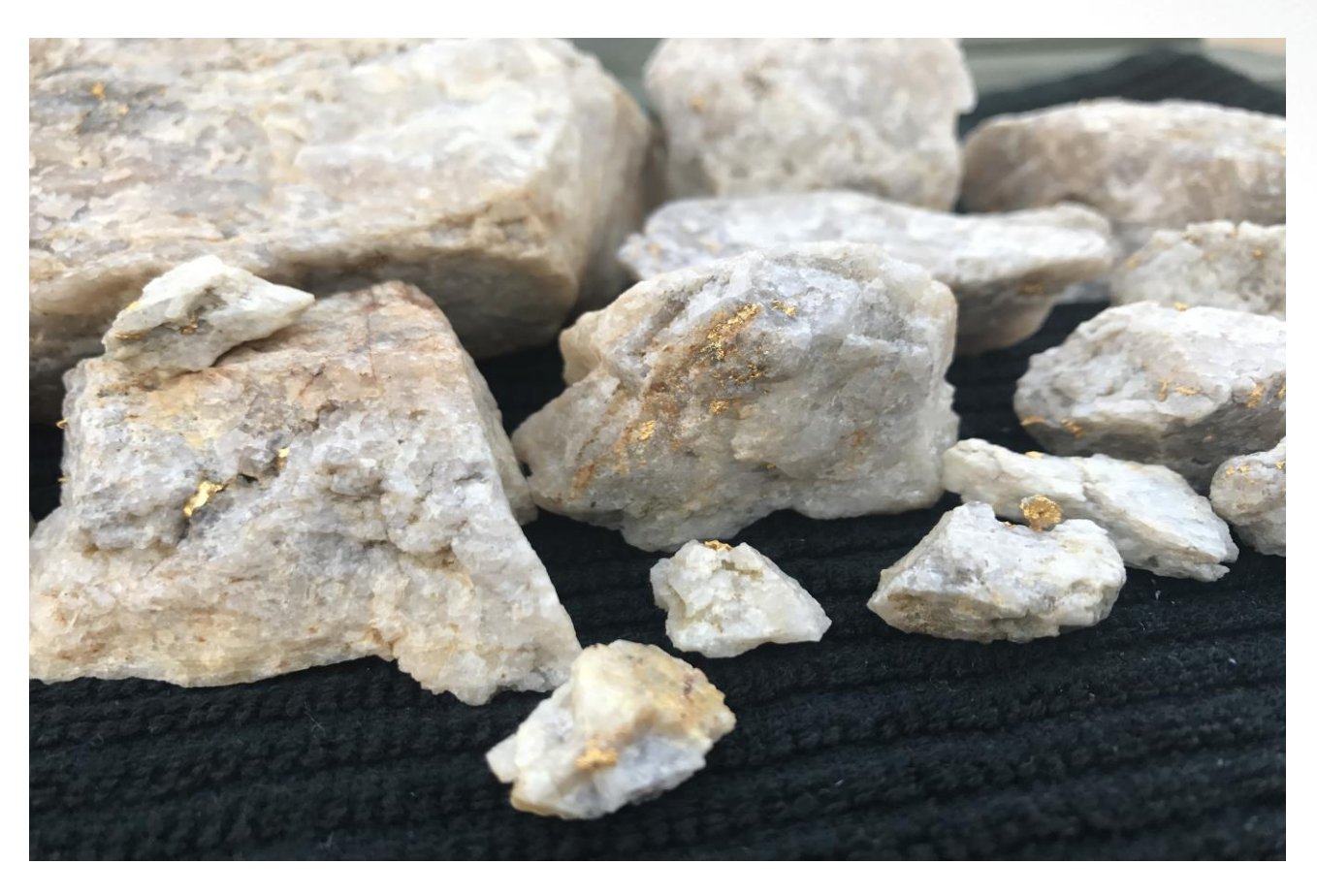
Figure 3: Example of visible gold in rock samples taken from around the Lady Ada deposit

The team has collected a number of samples showing clearly visible gold - reaffirming the deposit's high-grade nature and potential.