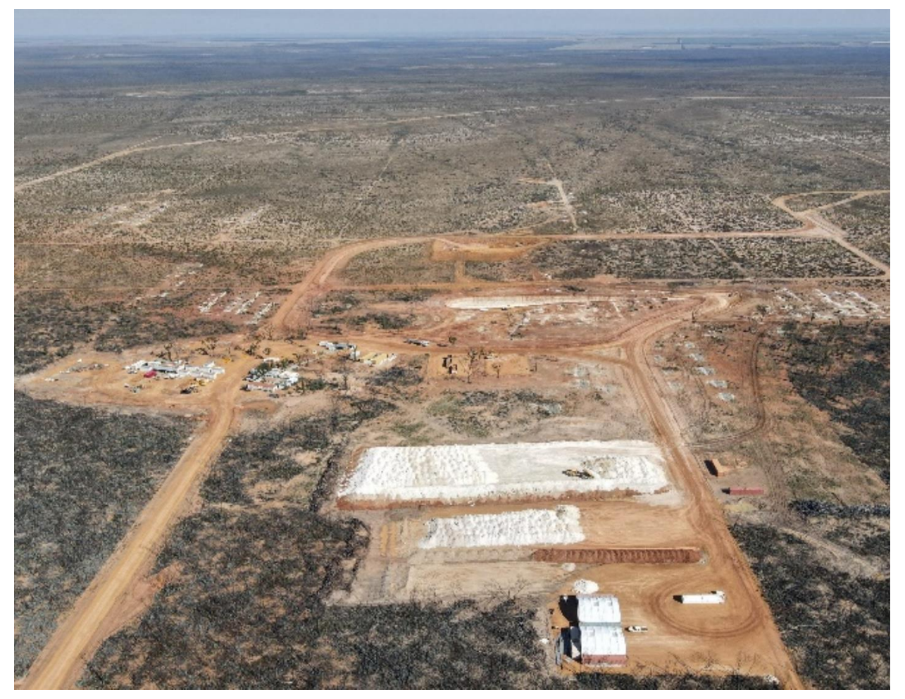
Figure 1: Kat Gap Bulk Sample Pit

CLASSIC MINERALS LIMITED 71 Furniss Rd, Landsdale Western Australia 6065 ASX: CLZ | ABN 77119 484 016 <u>contact@classicminerals.com.au</u>