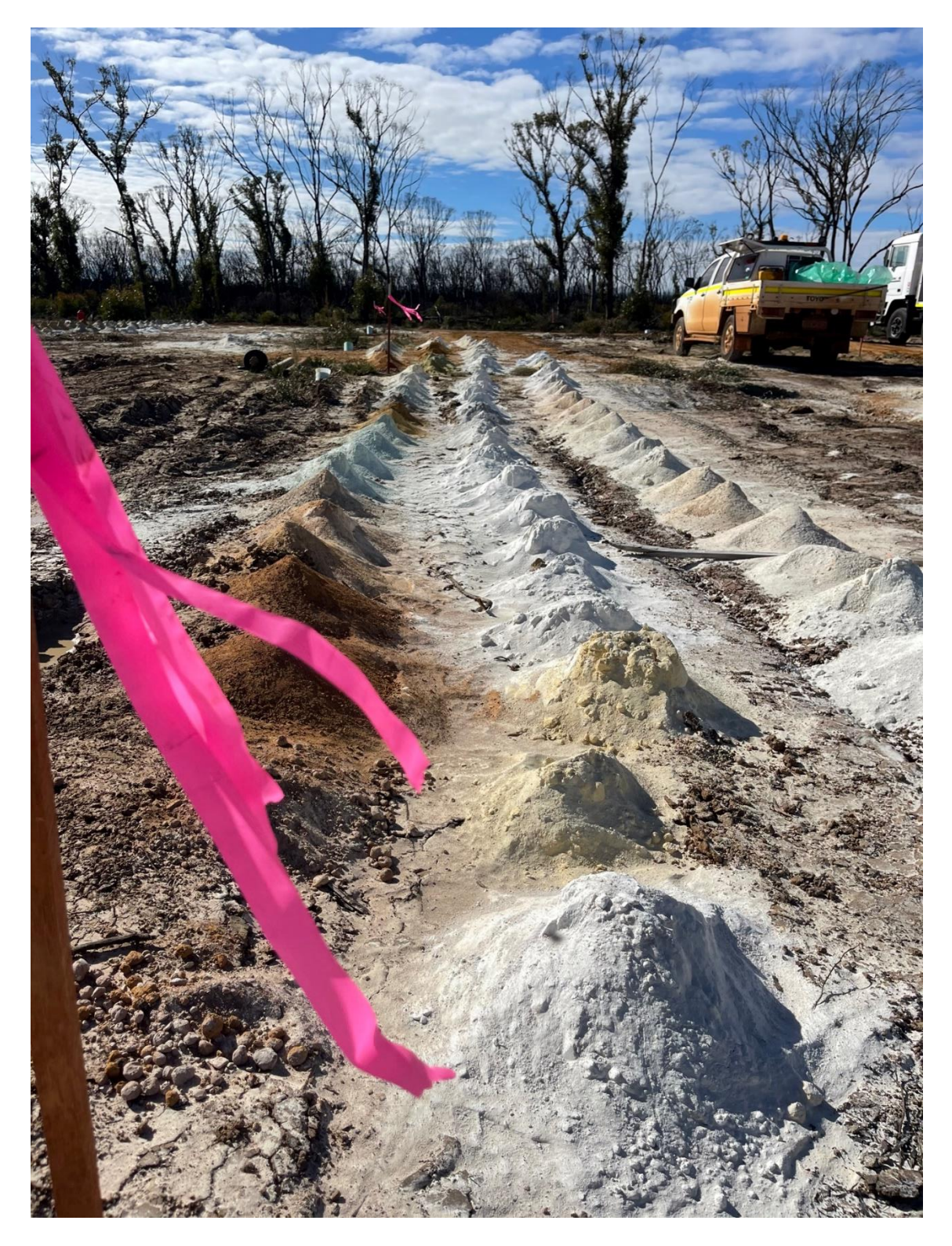
Figure 3: Infill RC Drilling at Kat Gap

71 Furniss Rd, Landsdale Western Australia 6065 ASX: CLZ | ABN 77119484016 <u>contact@classicminerals.com.au</u>