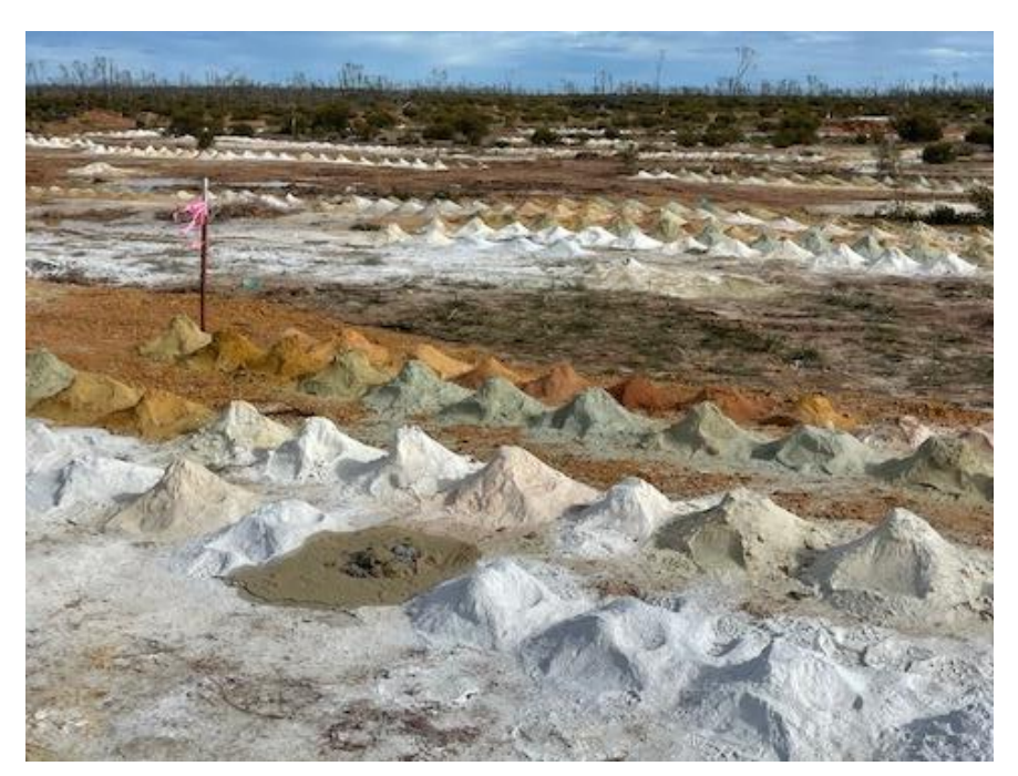
Figure 2: Infill RC Drilling at Kat Gap

The RC drilling program was suspended again due to severe weather conditions experienced on-site. Drilling has resumed onsite.