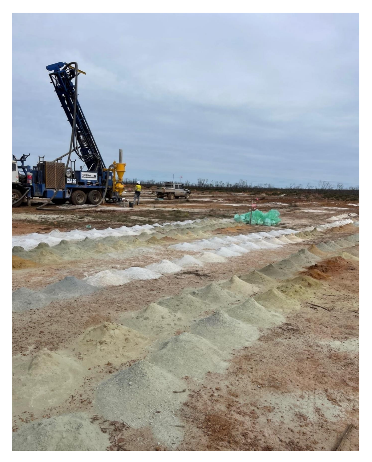
Figure 4: Infill RC Drilling at Kat Gap

71 Furniss Rd, Landsdale Western Australia 6065 ASX: CLZ | ABN 77119484016 <u>contact@classicminerals.com.au</u>