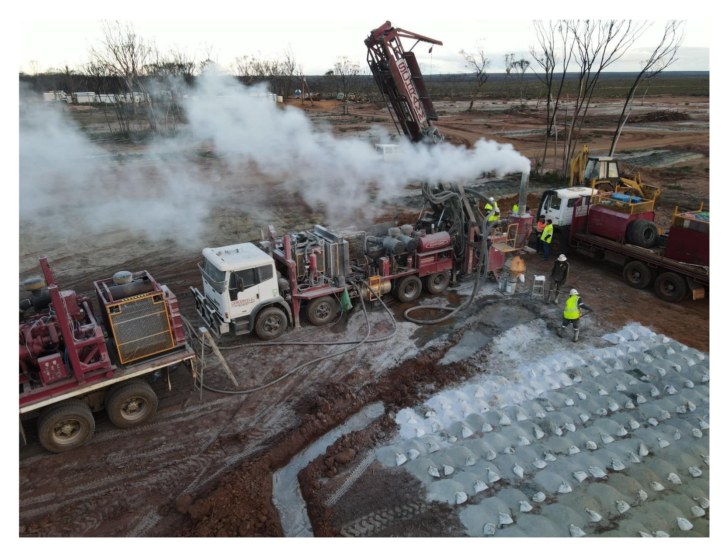
Figure 4: RC Drilling at Kat Gap

71 Furniss Rd, Landsdale Western Australia 6065 ASX: CLZ | ABN 77119484016 <u>contact@classicminerals.com.au</u>