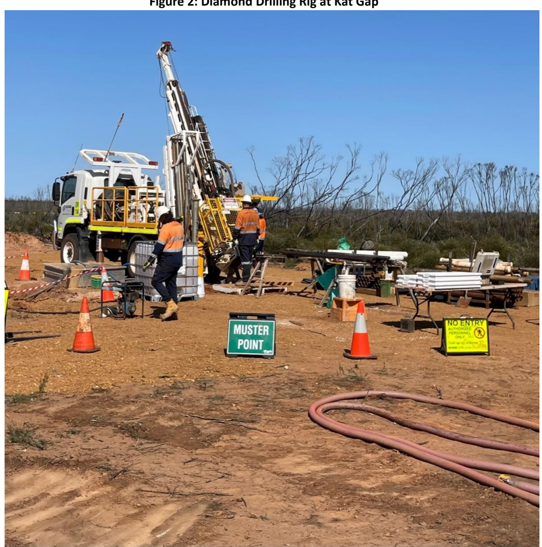
Figure 2: Diamond Drilling Rig at Kat Gap

The overall infill RC drilling program consisted of 109 holes for 7,110. Currently 85 holes for 5,085m have been completed to date. The remaining holes in the program should be completed in the next couple of weeks. Assay results will be released to the market as they become available.