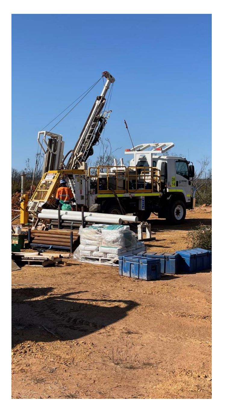
Figure 3: Diamond Drilling Rig at Kat Gap

71 Furniss Rd, Landsdale Western Australia 6065 ASX: CLZ | ABN 77119484016 <u>contact@classicminerals.com.au</u>