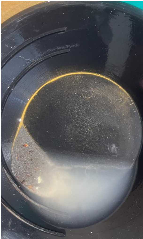
Figure 3: Gold particles from panning concentrate.

Classic Minerals Ltd is grateful for the support and dedication of its employees, stakeholders, and project partners who have contributed to the successful commissioning and completion of the Kat Gap Processing Plant. The company remains focused on delivering strong results and creating long-term value for its shareholders.