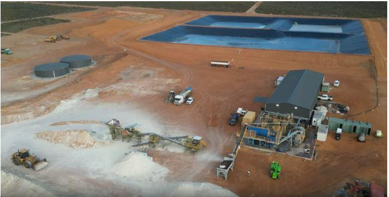
Figure 2: Kat Gap Processing Facility.