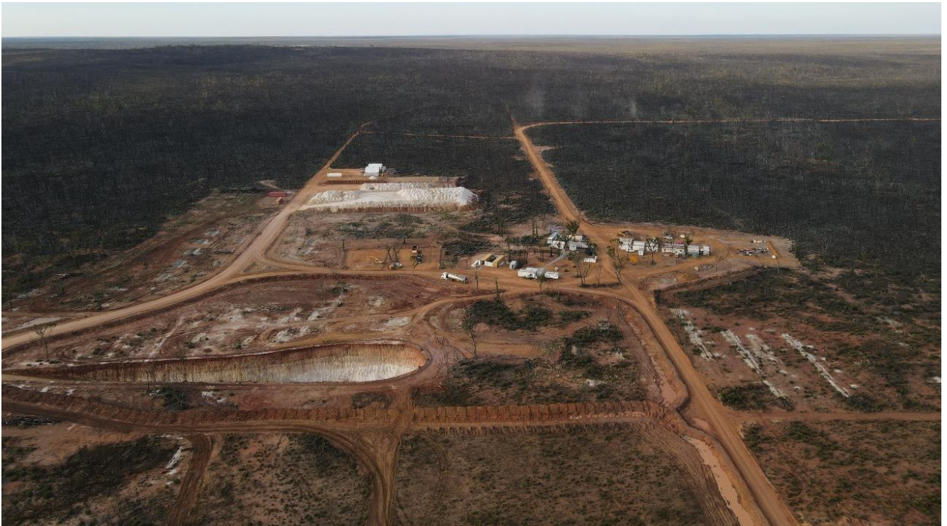
Figure 1: Kat Gap.