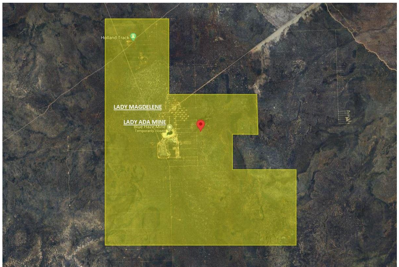
Figure 3: Satellite Image of M77/1310 approved tenement

The Company also, successfully applied for a Mining Lease over parts of the Forrestania Tenements. The Mining Lease was granted by the Department of Mines, Industry Regulation and Safety over the tenement area below, as announced on 22 May 2024.